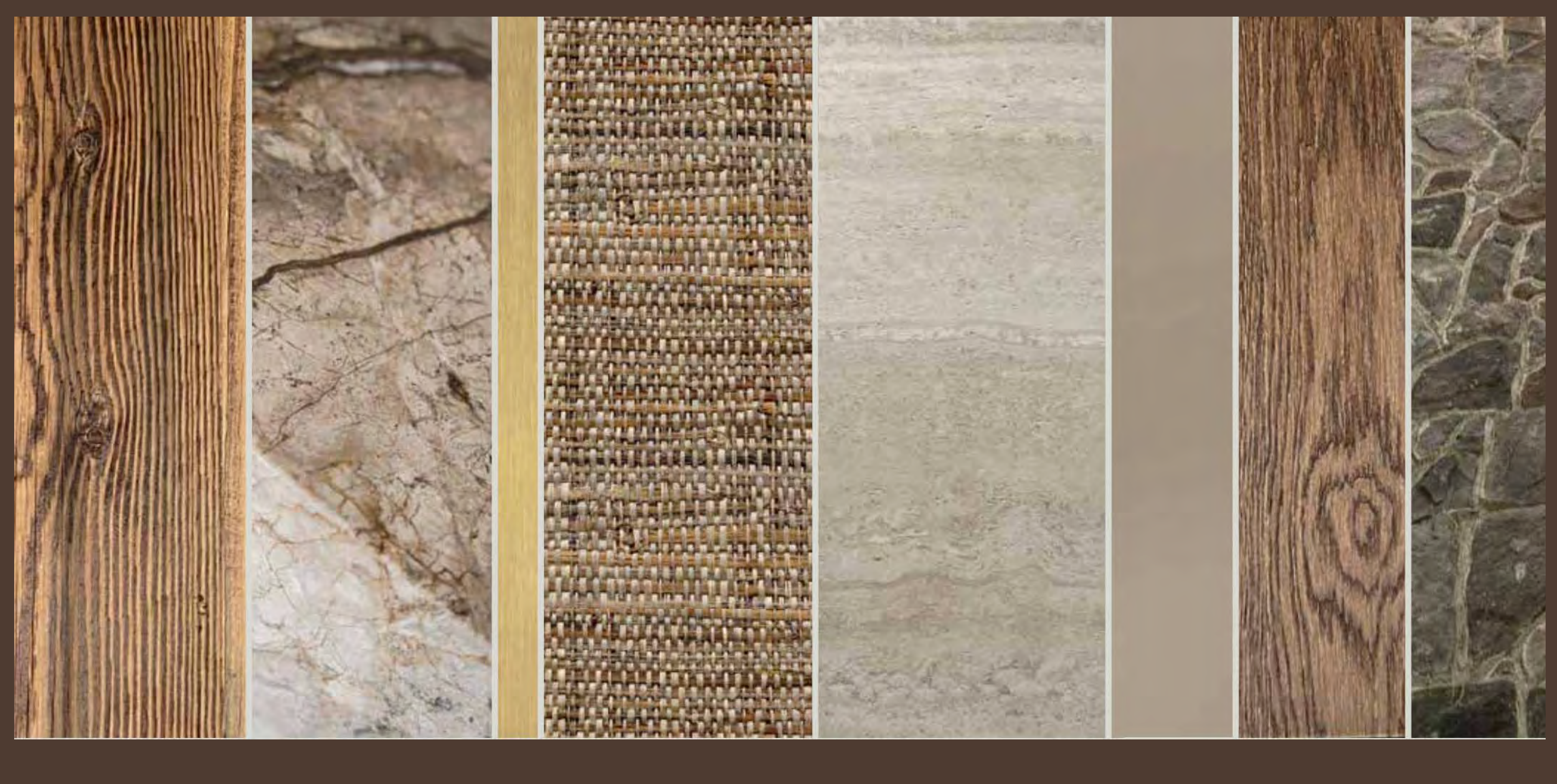
Note: the interior & design is stil under development and is only an impression